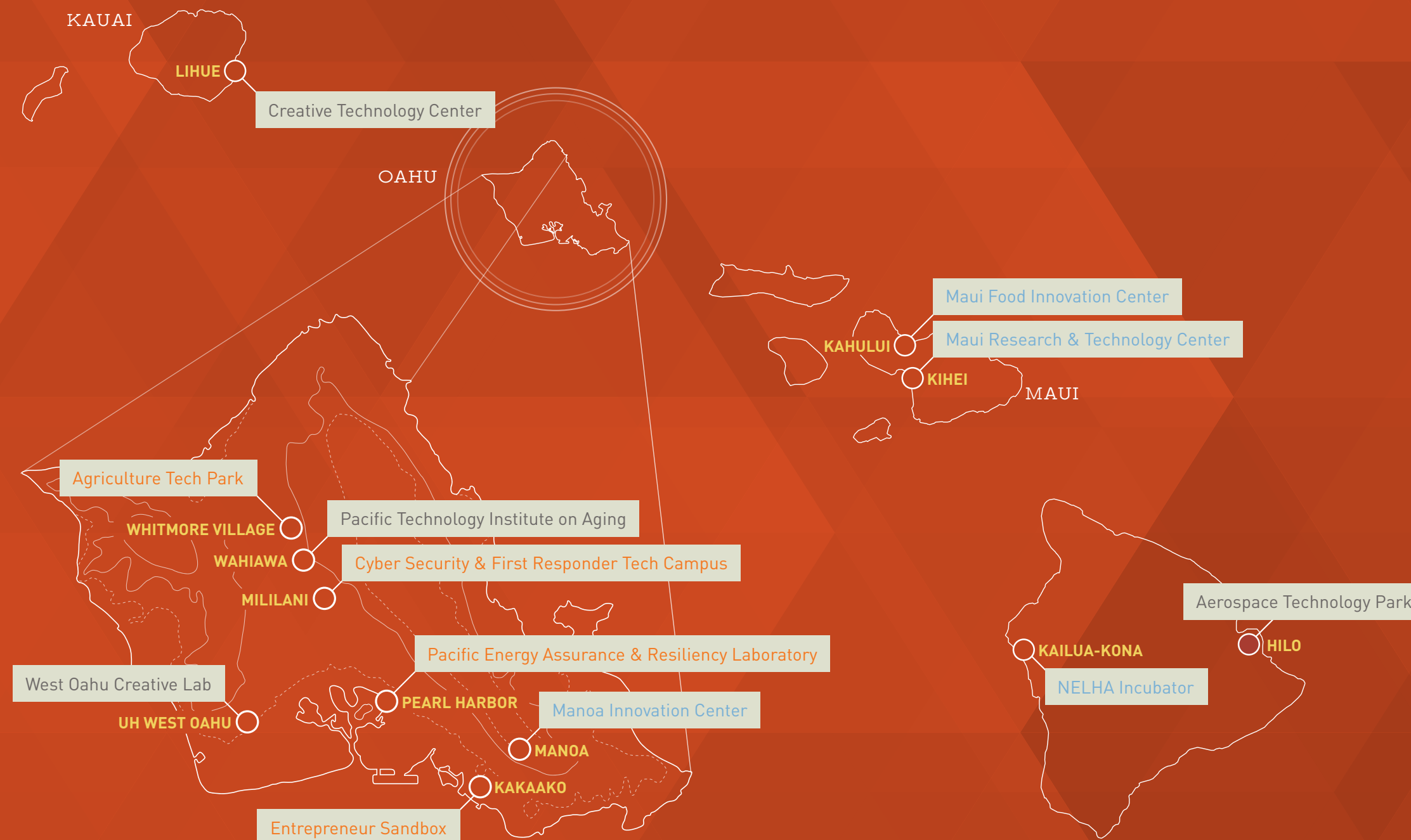
STATE AND COUNTY TECHNOLOGY CENTERS ACROSS HAWAII

Innovation is happening throughout the state. State and county agencies are partnering with HTDC to create dynamic innovation hubs across the state.