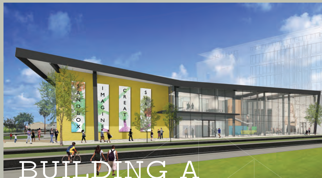
THE ENTREPRENEUR SANDBOX IN KAKAOKO

3 companies graduated from the incubator program.