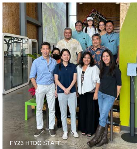
FY23 HTDC STAFF

Dear Stakeholders, Collaborators, and Supporters,