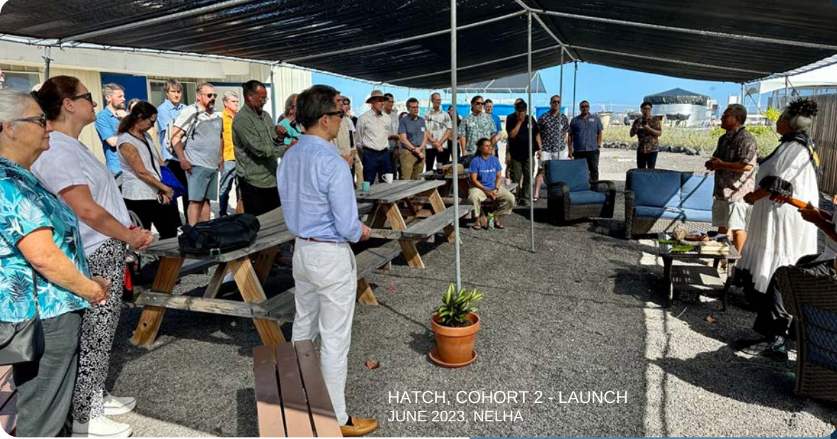
HATCH, COHORT 2 - LAUNCH JUNE 2023, NELHA