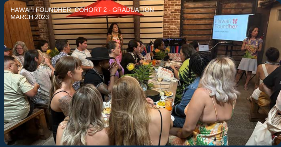
HAWAII FOUNDER, COHORT 2 - GRADUATION MARCH 2023