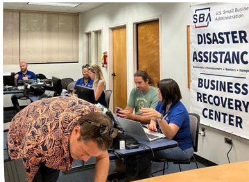
MRTC, SBA BUSINESS RECOVERY CENTER

This year MRTC similarly started seeing a recovery of events and workshops such as Maui Tech Ohana and general networking to bring community together. In August of 2023, MRTC began support for Maui disaster recovery efforts by providing SBA with a home office to centralize operations, and FEMA for additional space needs.