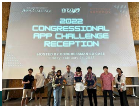
CONGRESSMAN ED CASE APP CHALLENGE FEB 2023

Starting early in 2023, the Sandbox began experiencing an over abundance of requests to help host in-person events to re-connect community through showcases of innovation, workshops, coworking and various networking opportunities. This year the Sandbox was also fortunate to have hosted many special VIP guests including Congressman Case, Hirono, and SBA Administrator Isabel Guzman.